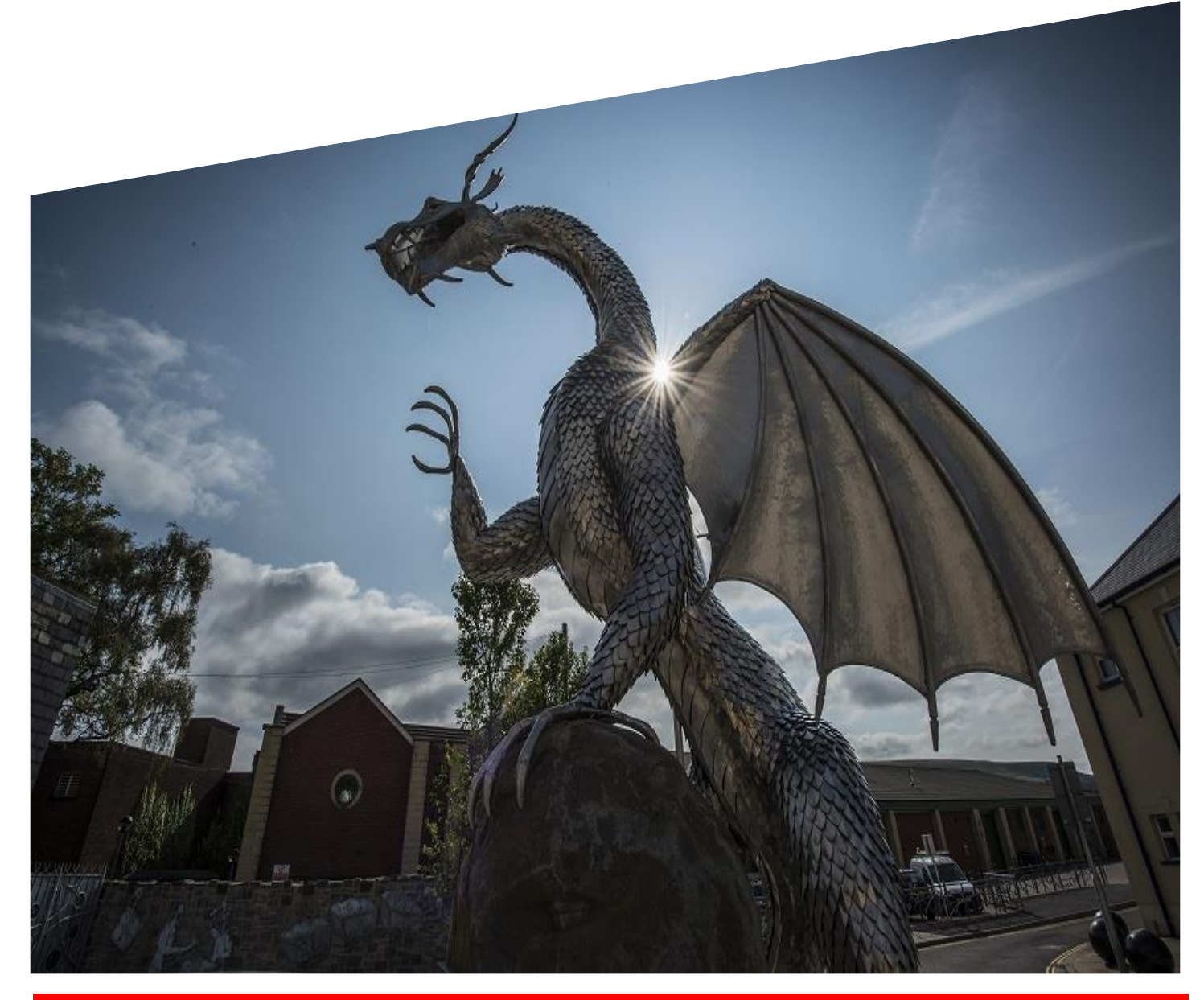
ORGANISATIONAL DEVELOPMENT DIVISION Issued: July 2023 Review: July 2024