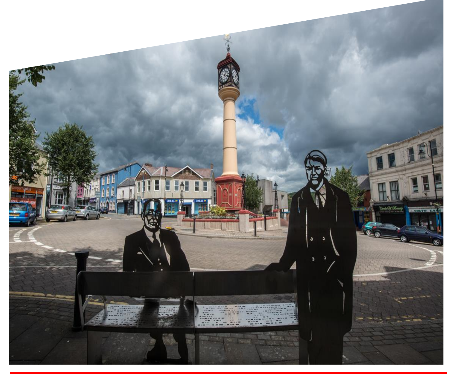
ORGANISATIONAL DEVELOPMENT DIVISION Issued: November 2017 Review: August 2022